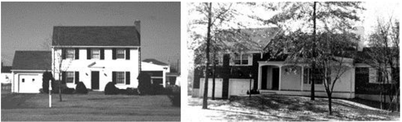
Houses at 6 North Circle, circa 1950, left; 1323 Moon Drive, 1957, right.

The family was active in the First Presbyterian Church of Morrisville.