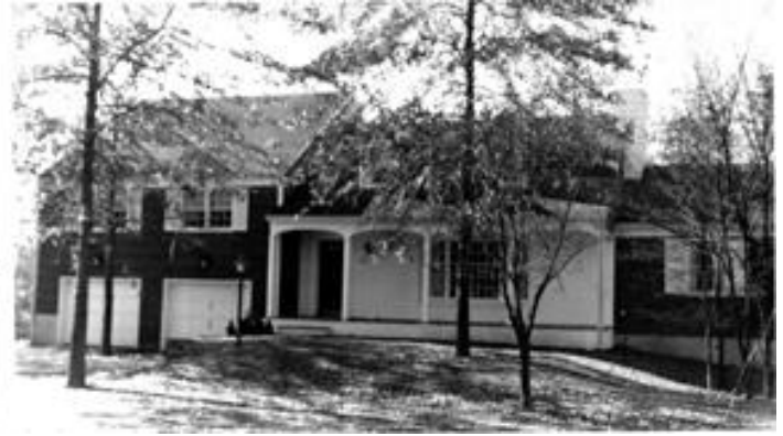
Houses at 6 North Circle, circa 1950, left; 1323 Moon Drive, 1957, right.

In 1957, the family built a new home at 1323 Moon Drive, 0.3 miles from the 6 North Circle house.